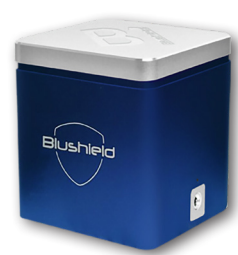
Ultimate B1 Cube

Further enhanced with Blushield's proprietary formula. The Ultimate B1 Cube is recommended as the minimum for most homes today.