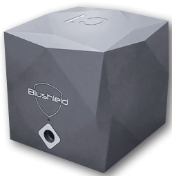
Ultimate C1 Cube

The Ultimate C1 Cube is stronger than the B1 Cube model with 4 international plugs and spanning up to 320 metre diameter sphere.